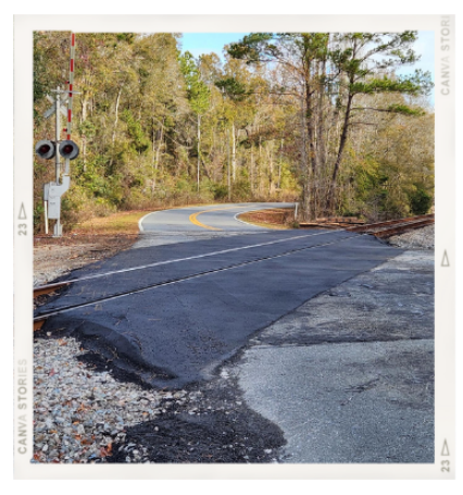
Capitola Rd. - After