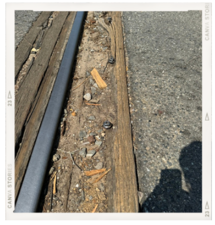
Chaires Cross Rd. - Before