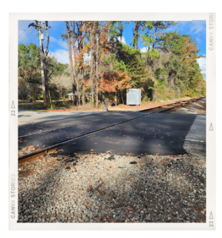
Benjamin Chaires Rd. - After