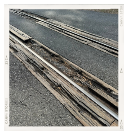
Capitola Rd. - Before