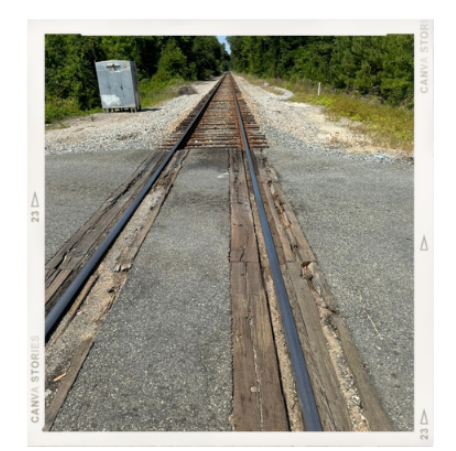
Baum Rd. - Before