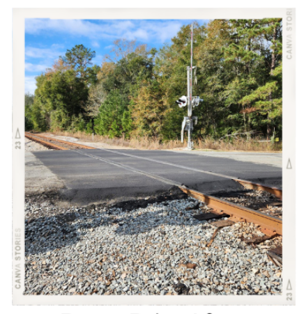
Baum Rd. - After