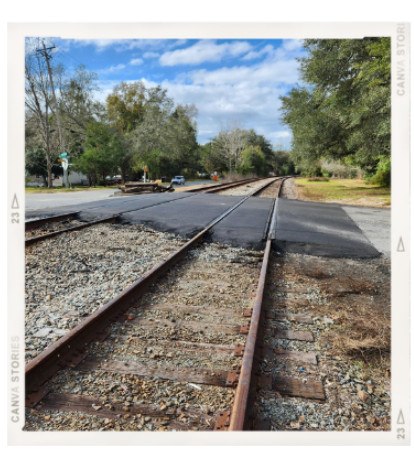
Chaires Cross Rd. - After