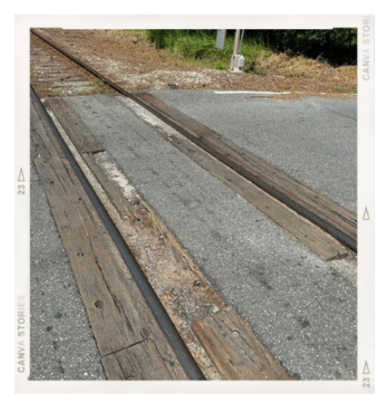
Benjamin Chaires Rd. - Before